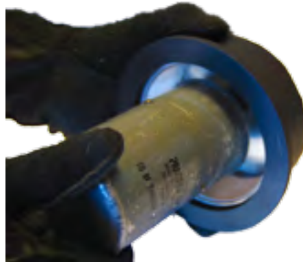
Screw grenade onto Cap