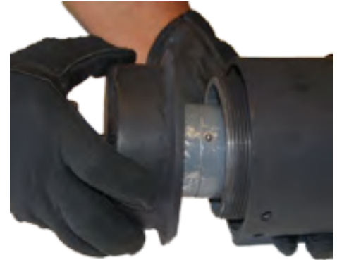
Screw Cap into Body.