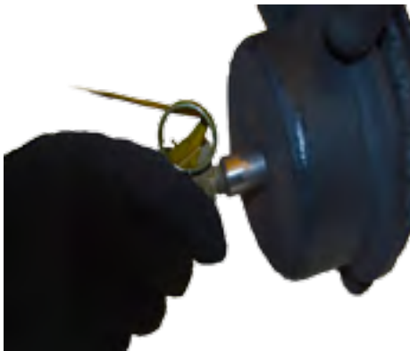
Screw Fuze into Cap

Always wear proper protective clothing, gloves and respirator.